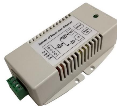
TP-DCDC-1248GD-HP 35W 802.3af/at